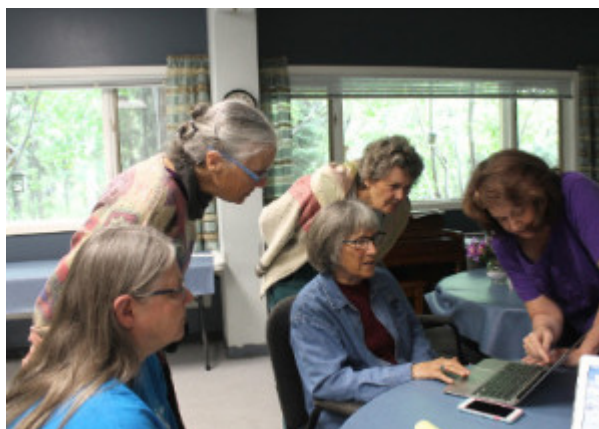
Happy Hour at Pike's